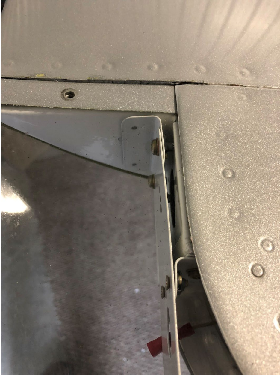
Three brackets assembled temporarily to align rivet holes and check clearance