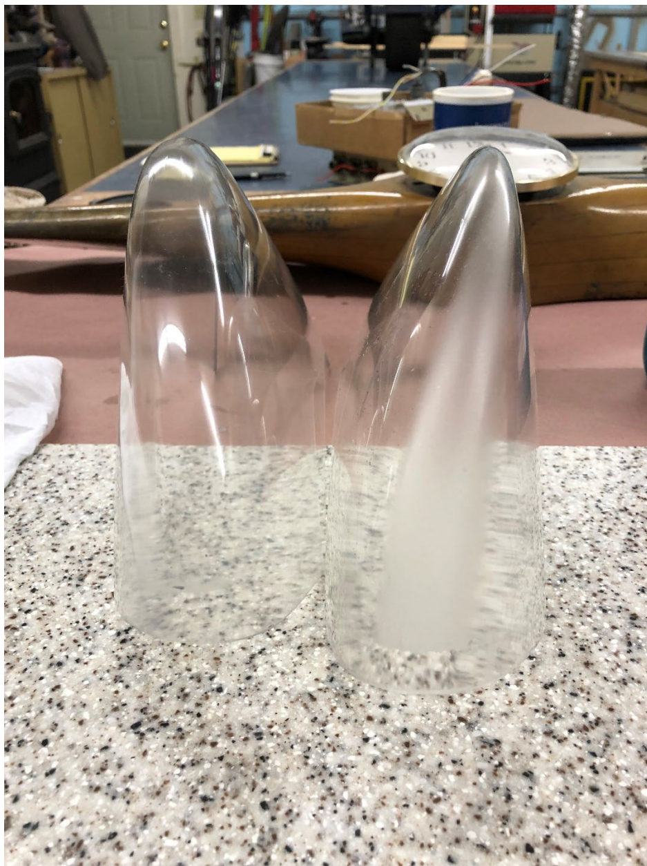
Polish lenses to remove frosting from ice/rain