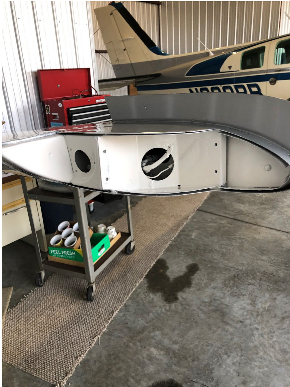
Old nav and strobe lights removed. Area cleaned and painted.

Note: These photos are provided by installers of the Gallagher Aviation Wingtip Bracket STC Kit as a visual aid and should not be used in lieu of the authorized installation instructions.