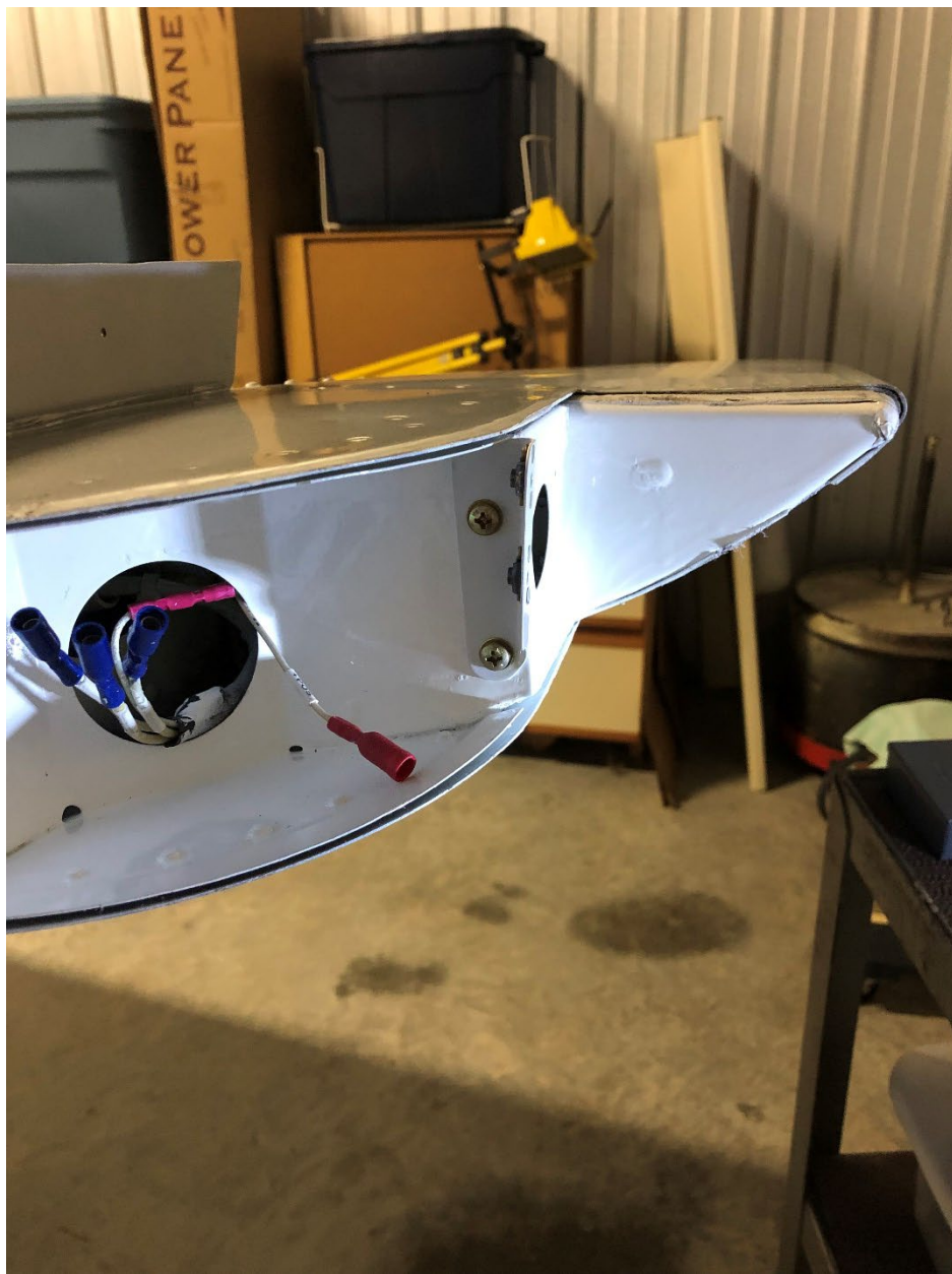
Right wingtip with bracket installed